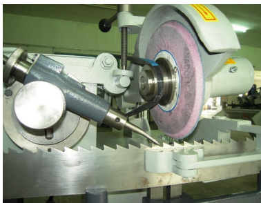
Fast grinding of band saws up to 100mm width.

Capacity: Grinding up to 40 band saws per day.