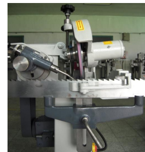
Rigid band saw holding.